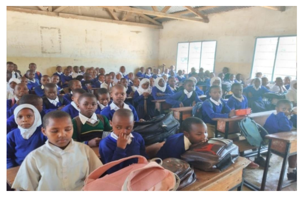
Figure 4.4.1: At school G Standard Four Pupils combined in the Class