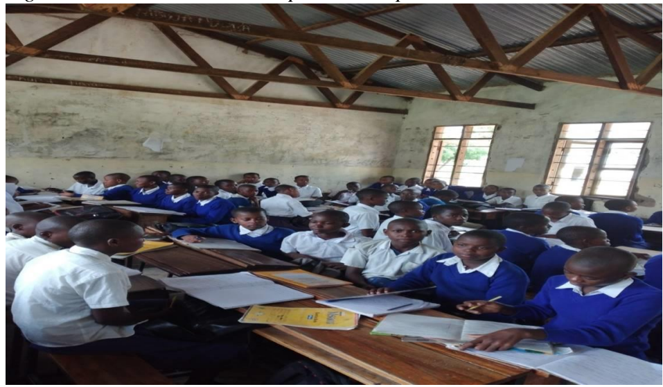
Figure 4.5.1: Standard Four Pupils in Groups at School J

improve writing, reading and numeracy because they got enough time to discuss even if there was no teacher, and even where there were not enough books or desks to sit on. Even under the tree, pupils could sit and discuss (an interview with the Academic Teacher of school F, which was held on 16th March 2021).